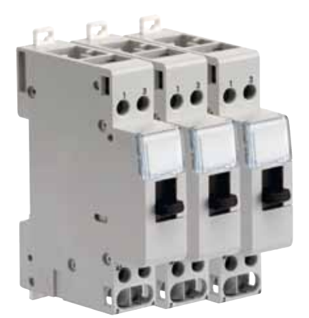
Circuit breakers for electrical installations: The high availability and productivity of KraussMaffei systems makes it possible to produce this type of part cost-effectively.