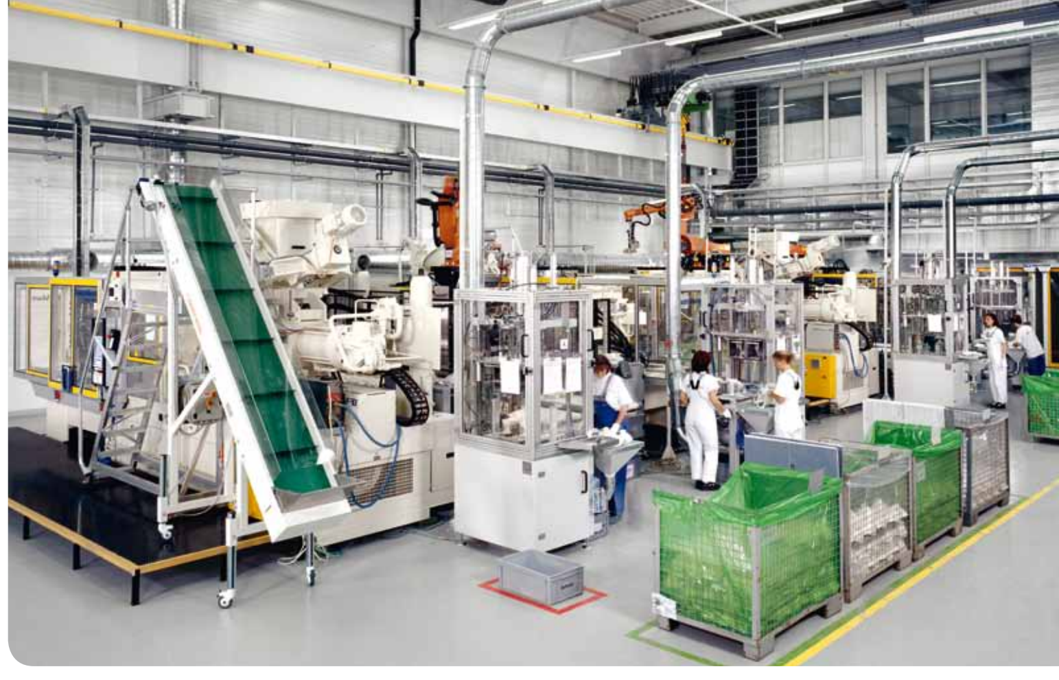
A high level of automation and Polyload AZ material stuffers allow Automotive Lighting to produce reflectors from BMC under constant processing conditions together with high product quality.

"We've built a reputation with our customers as an absolutely reliable supplier. They expect us to keep exactly to agreed delivery schedules and to supply high volumes of high quality products. The KraussMaffei Polyload AZ solution helps Automotive Lighting do just this. Thanks to the continuous feed and the automatic control of the stuffing pressure, we are able to produce under constant processing conditions. The large capacity of the material hopper for the screw feed reduces the number of top-ups required, keeping labour effort lower. These features and the fact that topping up the hopper is really easy, help to increase the availability of our systems."