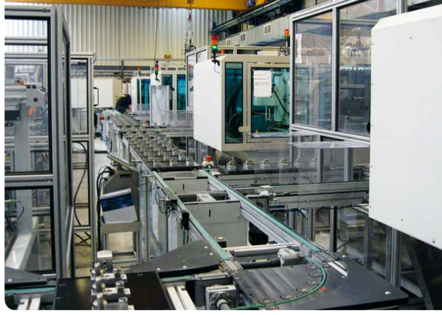
Production line for throttle valve bodies, part of thermoset production at Christophery. The precision of the moulding operation reduces the need for post-mould processing.